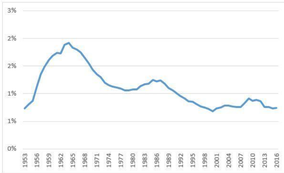
Federal Expenditures on R&D as a percent of GDP (1953-2016)

Source: National Science Foundation, 2016.