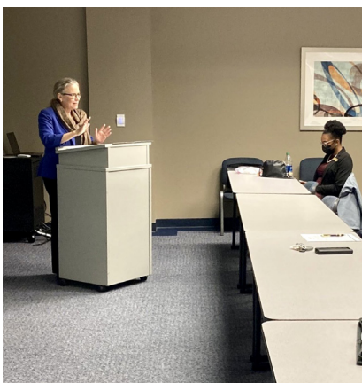
Rep. Bourdeaux Hosts Small Business Roundtable in GA-07