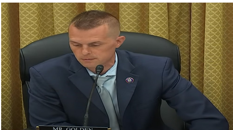
Rep. Golden Chairs Subcommittee Hearing on Right to Repair for Small Businesses

September: Golden Examines Impact of Right to Repair on Small Businesses