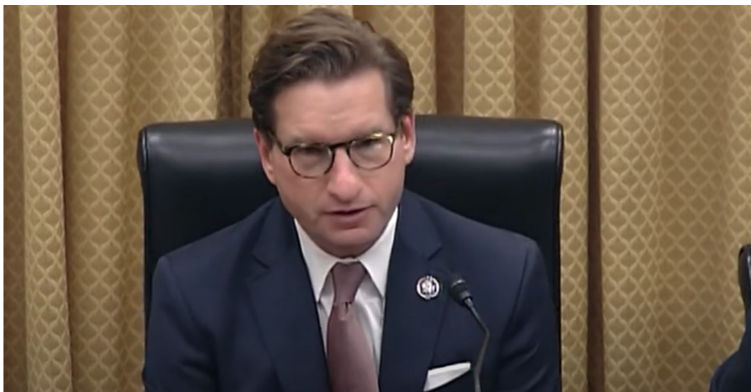
Subcommittee Chairman Phillips speaks at committee hearing on Paycheck Protection Program

Subcommittee Chairman Dean Phillips held a hearing examining the landmark Paycheck Protection Program (PPP) and its effectiveness in delivering relief to small businesses. The hearing featured testimony from leading academics and government officials on their research into the forgivable loan program.