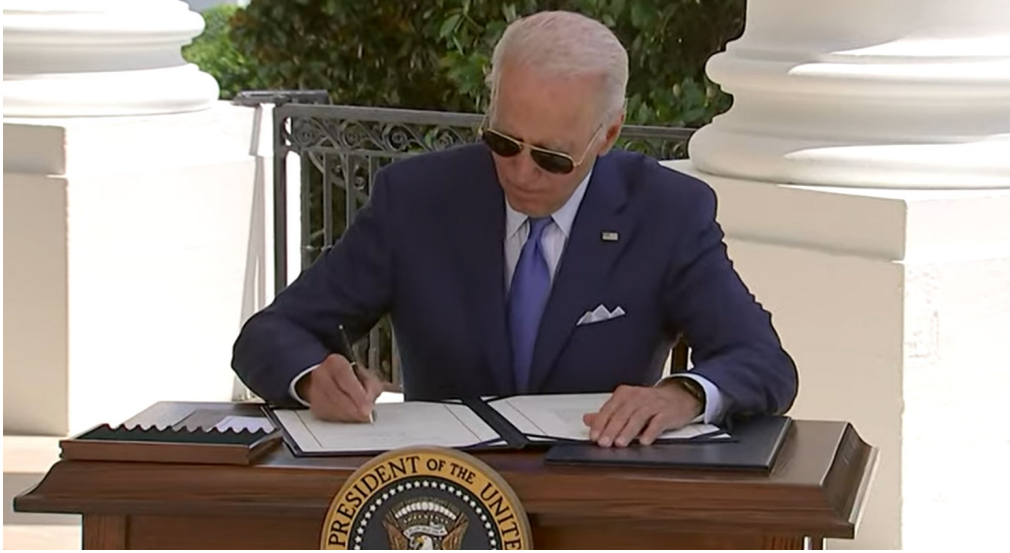
President Biden signs small business fraud statute of limitations bills into law

President Joe Biden signed into law the PPP and Bank Fraud Enforcement Harmonization Act and the COVID-19 EIDL Fraud Statute of Limitations Act of 2022. These two bills, introduced by Chairwoman Nydia M. Velázquez (D-NY) and Ranking Member Blaine Luetkemeyer extended the statute of limitations for certain fraud cases involving the Paycheck Protection Program (PPP) and COVID-19 Economic Injury Disaster Loan (EIDL) program.