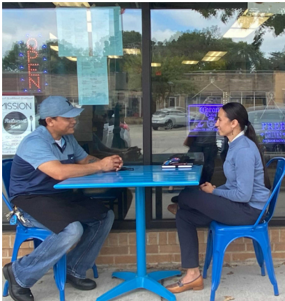
Rep. Davids Meets with Small Business Owner in KS-03