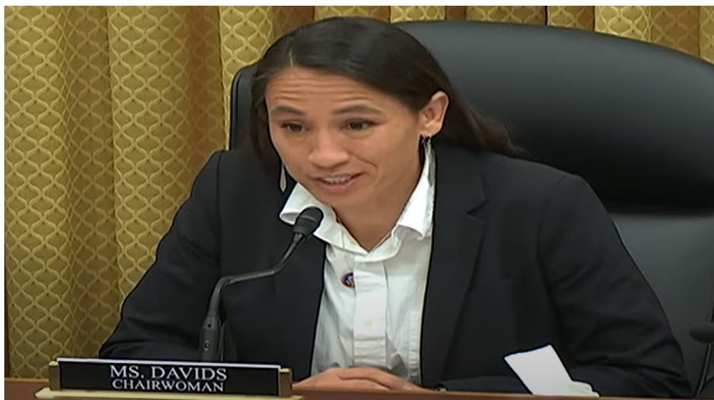
Chairwoman Davids holds hearing on boosting small business exporting

Rep. Sharice Davids (D-KS), Chairwoman of the Subcommittee on Economic Growth, Tax, and Capital Access, convened a panel of trade experts and small business exporters to discuss how international trade can fuel small business recovery and growth. The hearing focused on the current state of the Small Business Administration's (SBA) State Trade Enhancement Program (STEP) and how potential improvements can help lower barriers for small businesses to sell their products overseas.