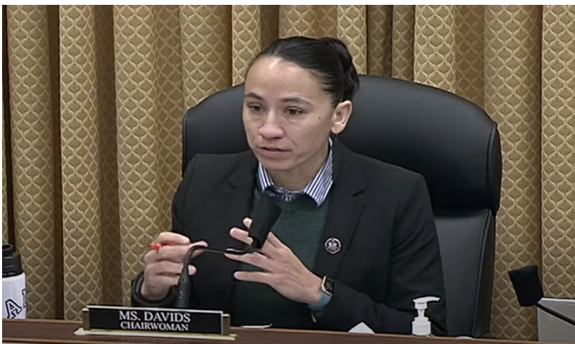
Rep. Davids Leads Subcommittee Hearing on Community Lending

March: Davids Looks to Empower Community Lenders to Reach Underserved Businesses