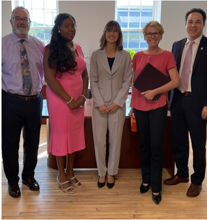
Rep. Houlahan Meets with Small Business Leaders in PA-06