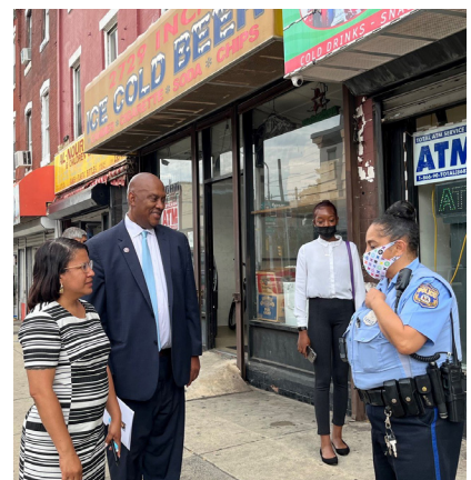
Rep. Evans Tours Black-Owned Businesses in Philadelphia, PA