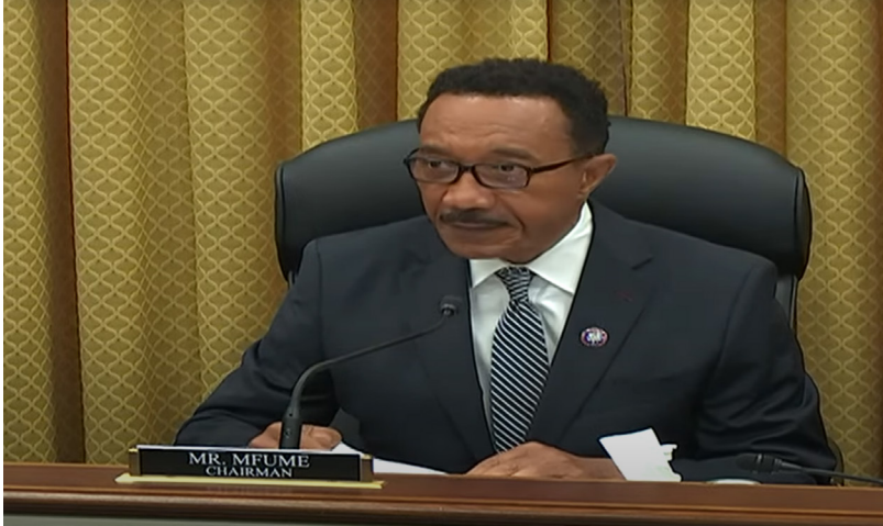
Rep. Mfume Chairs Subcommittee Hearing on Improving HUBZone Contracting Program

July: Mfume Eyes Improvements to SBA HUBZone Contracting Program