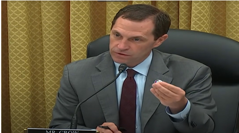
Rep. Crow Holds Hearing on Youth Apprenticeships and Small Businesses

September: Crow Looks to Youth Apprenticeships to Strengthen Small Business Workforce