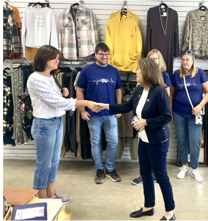
Rep. Craig Tours a Small Business in MN-02