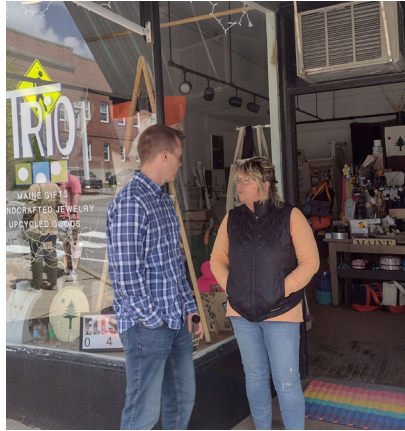
Rep. Golden Visits a Small Business in Ellsworth, ME