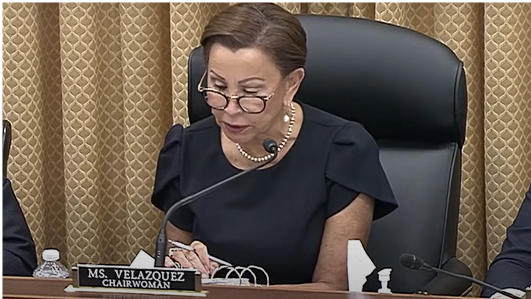
Chairwoman Velázquez leads committee markup of seven bipartisan bills.

On this day, the House Small Business Committee passed seven bipartisan bills to extend the statute of limitations on small business pandemic fraud cases, enhance workforce development offerings, and improve the procurement process for small businesses.