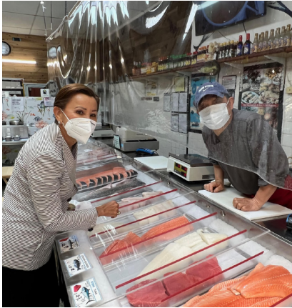
Chairwoman Velázquez visits Carroll Gardens Fish Market in Brooklyn, NY