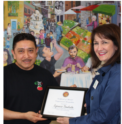
Rep. Newman Presents Award to a Small Business Owner in IL-03