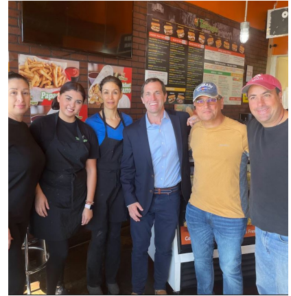
Rep. Crow Tours Las Tortugas in Aurora, CO