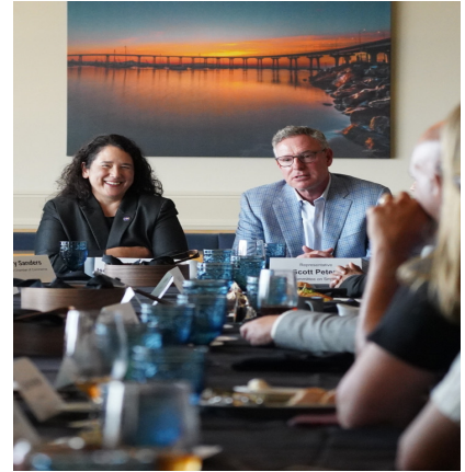
Rep. Peters Meets with Small Businesses and Administrator Guzman in CA-52