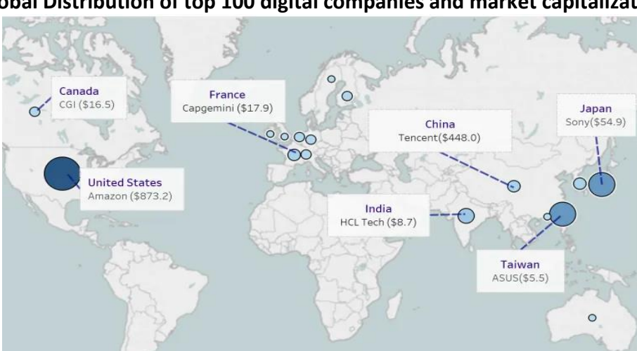
Global Distribution of top 100 digital companies and market capitalization